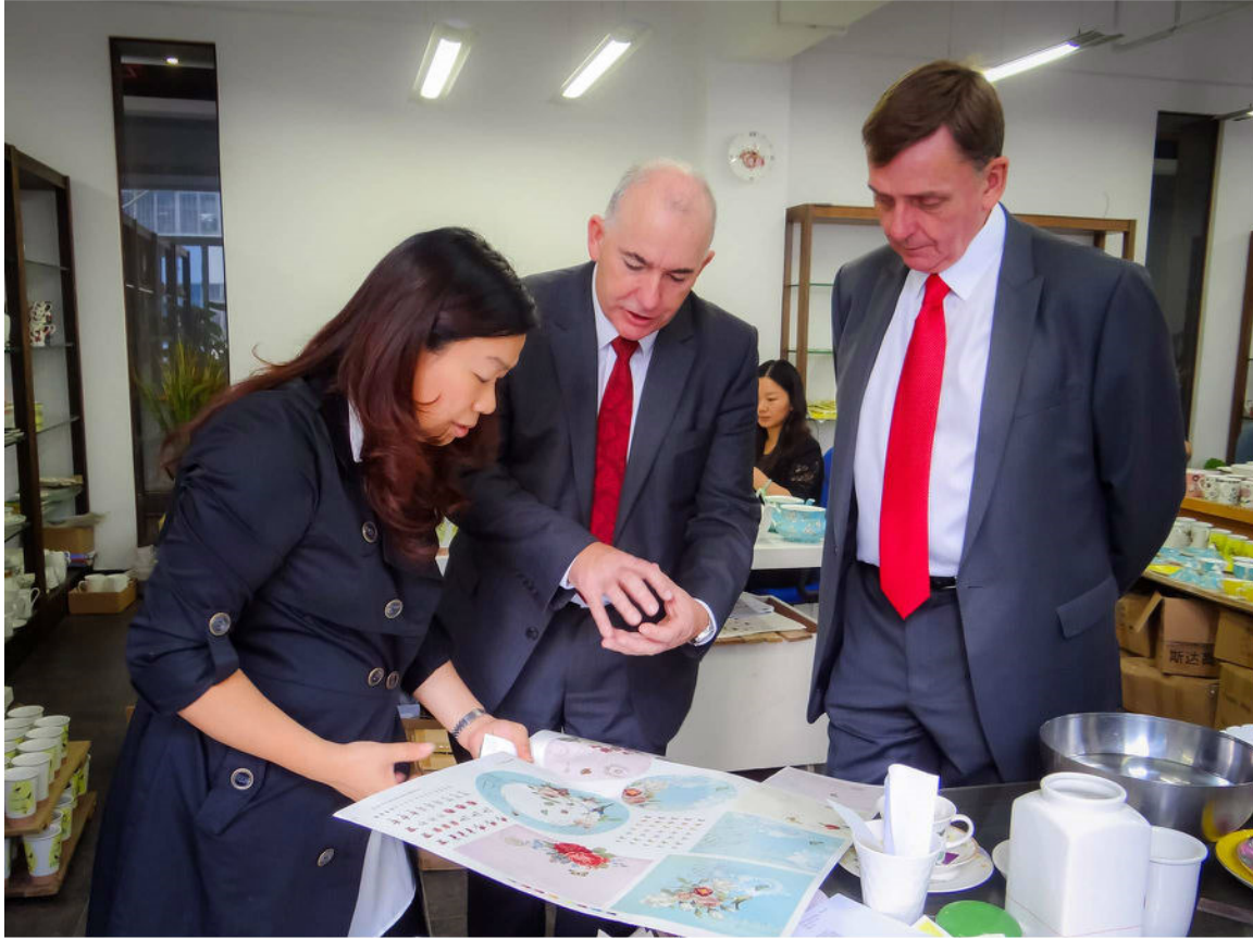
Observing how printed decal could be applied on to the china.