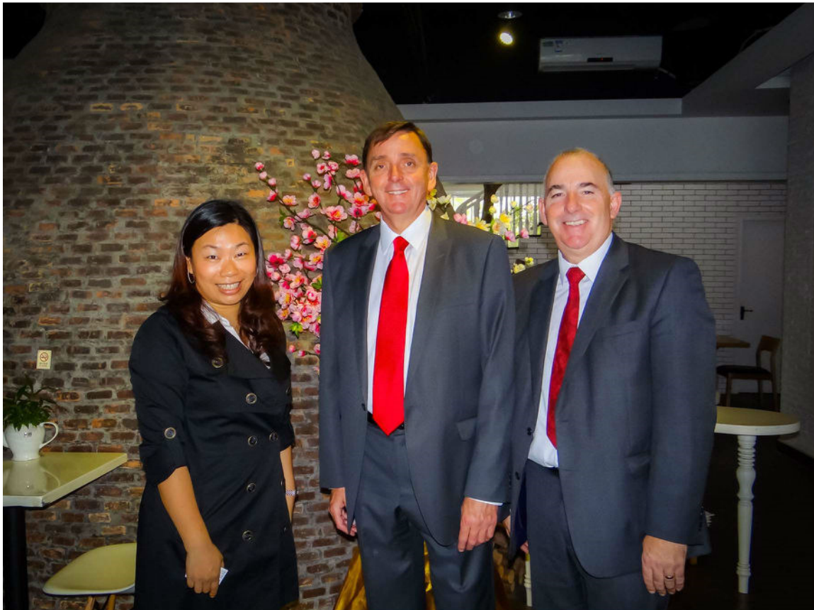
Thank you very much for Sir Robin Wales of England Newham Mayor visiting Stehcol! We are glad them visit us here in Shenzhen China long journey from England.