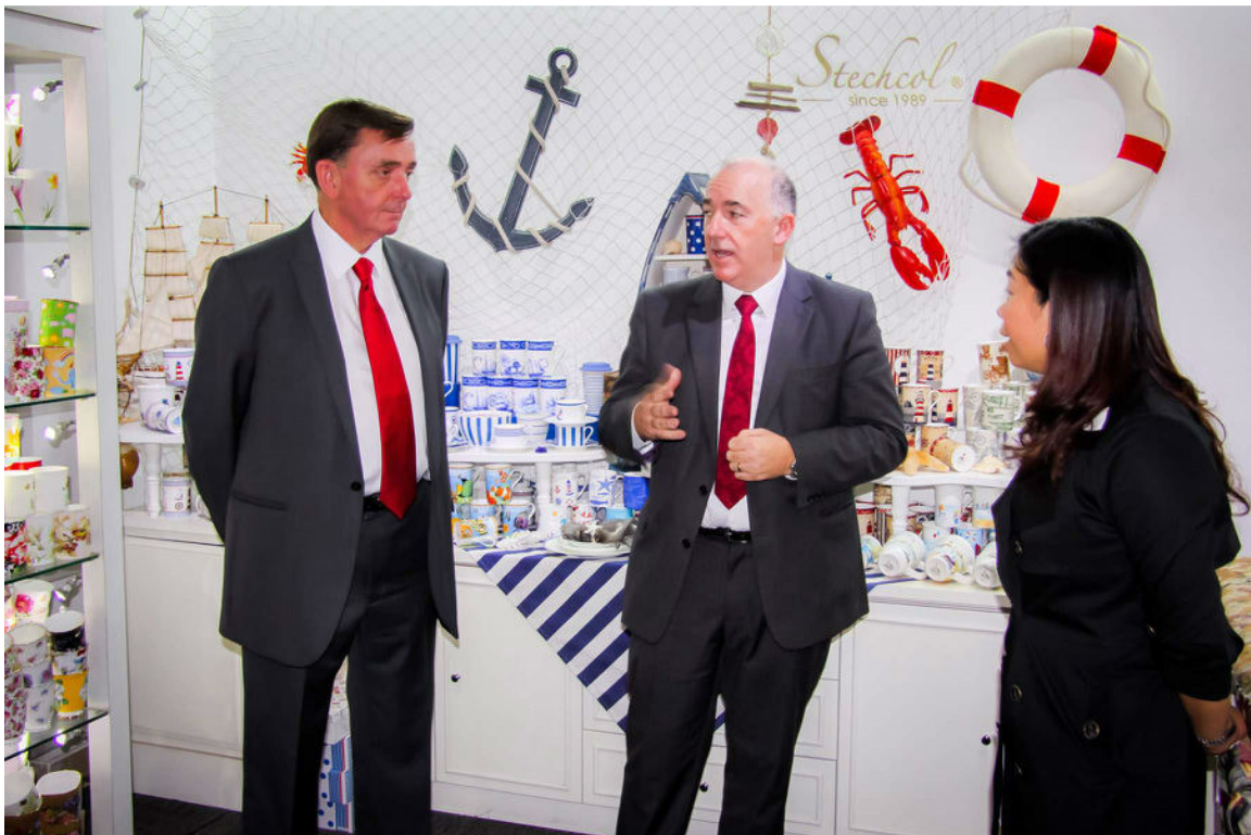
Sir Robin Wales also visited Stechcol's show room which located upstairs of the art gallery